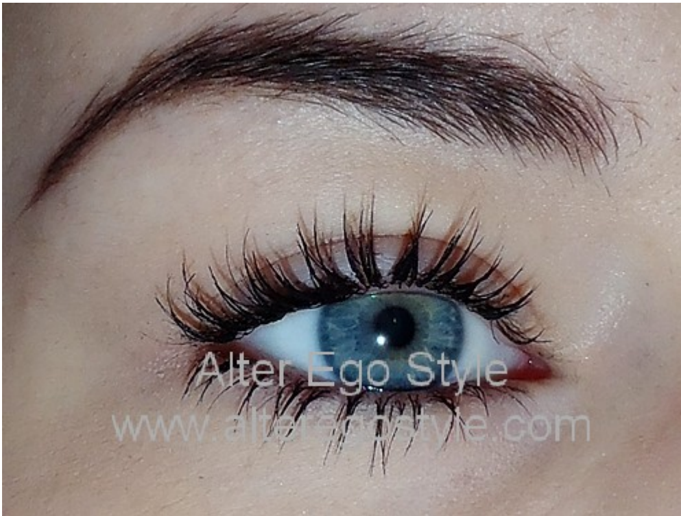
Drugi nanos maskare: